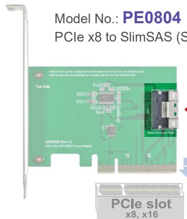
Model No.: PE0804 PCIe x8 to SlimSAS (SFF-8654) 8-Lane Adapter