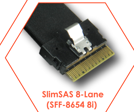
SlimSAS 8-Lane (SFF-8654 8i)