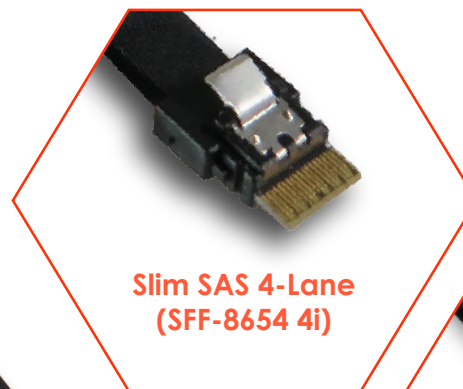
Slim SAS 4-Lane (SFF-8654 4i)